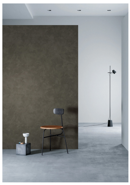
Product may vary in color, texture, finish and scale

Product Characteristics Product Performance Stain Resistance Resistance to Solvents, Cleaners and other Chemicals Cleaning and Maintenance Application and Removal Adhesion Compatibility with Application Surfaces