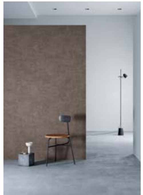
Product may vary in colour, texture, finish and scale