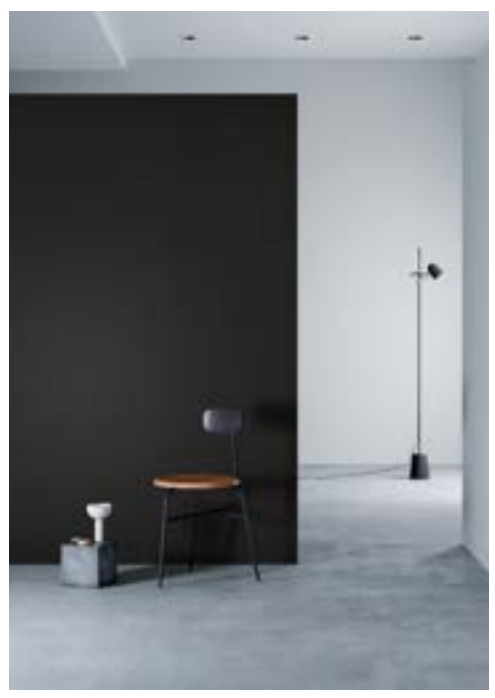
Product may vary in colour, texture, finish and scale

Product Characteristics Product Performance Stain Resistance Resistance to Solvents, Cleaners and other Chemicals Cleaning and Maintenance Application and Removal Adhesion Compatibility with Application Surfaces