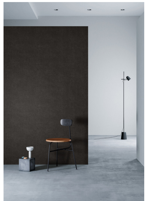
Product may vary in color, texture, finish and scale