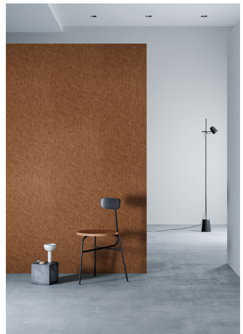
Product may vary in color, texture, finish and scale