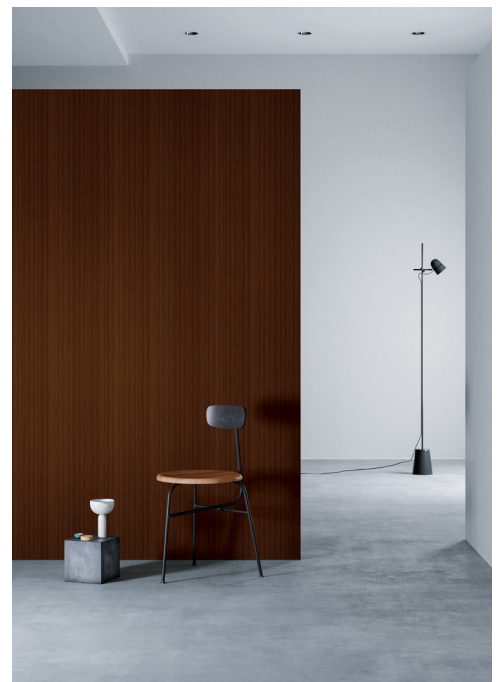
Product may vary in color, texture, finish and scale