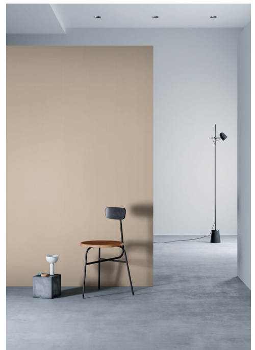
Product may vary in color, texture, finish and scale