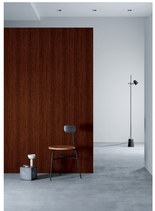
Product may vary in color, texture, finish and scale