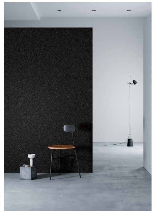
Product may vary in colour, texture, finish and scale