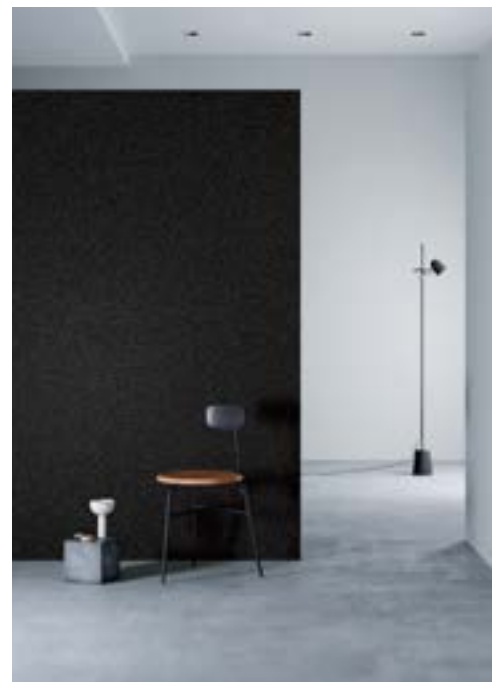
Product may vary in colour, texture, finish and scale