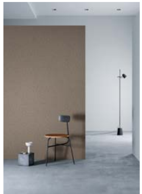
Product may vary in colour, texture, finish and scale