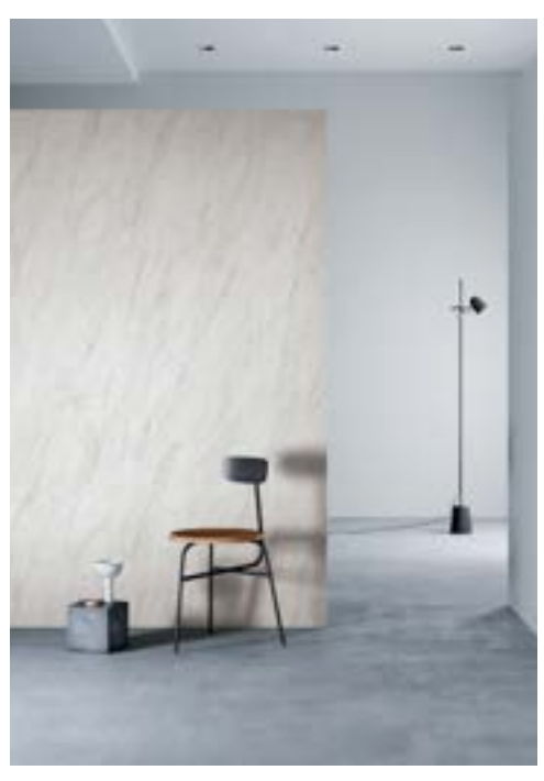
Product may vary in colour, texture, finish and scale

Product Characteristics Product Performance Stain Resistance Resistance to Solvents, Cleaners and other Chemicals Cleaning and Maintenance Application and Removal Adhesion Compatibility with Application Surfaces