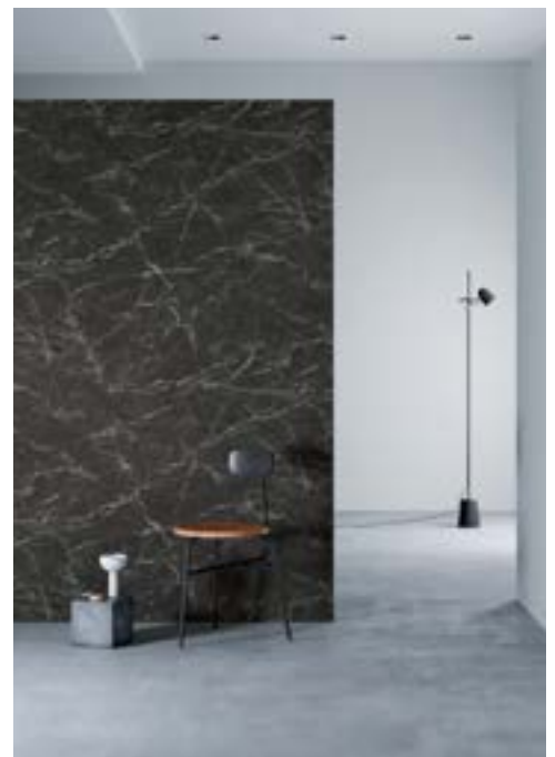
Product may vary in colour, texture, finish and scale