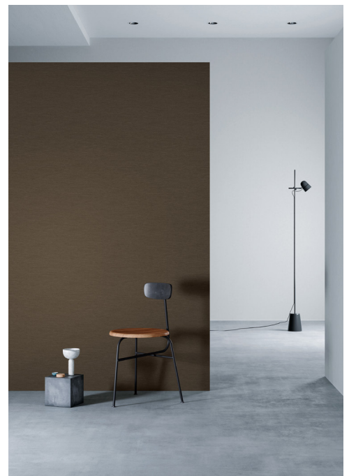
Product may vary in colour, texture, finish and scale