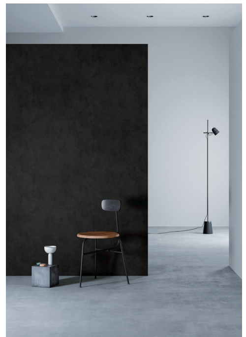
Product may vary in colour, texture, finish and scale