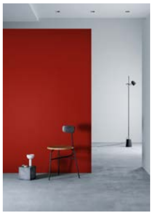
Product may vary in colour, texture, finish and scale

Product Characteristics Product Performance Stain Resistance Resistance to Solvents, Cleaners and other Chemicals Cleaning and Maintenance Application and Removal Adhesion Compatibility with Application Surfaces