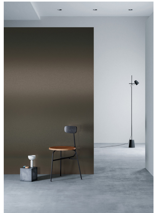
Product may vary in colour, texture, finish and scale