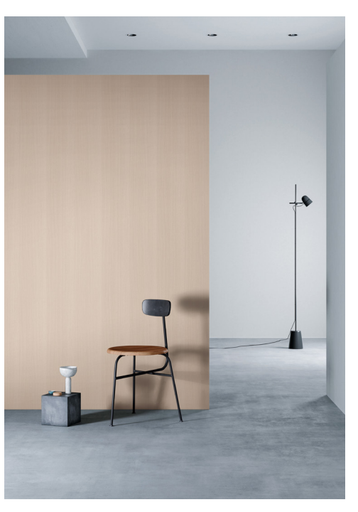
Product may vary in color, texture, finish and scale

Product Characteristics Product Performance Stain Resistance Resistance to Solvents, Cleaners and other Chemicals Cleaning and Maintenance Application and Removal Adhesion Compatibility with Application Surfaces