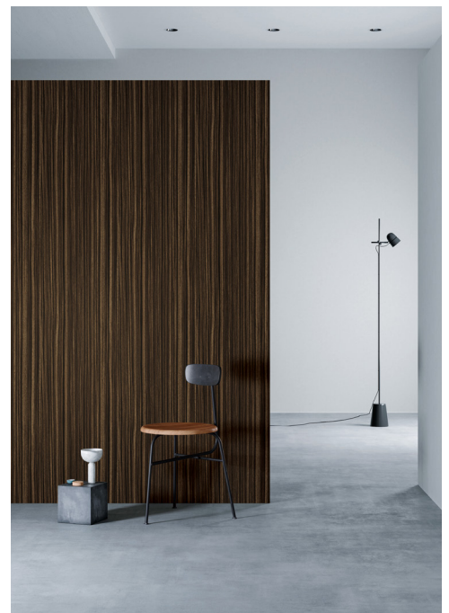
Product may vary in color, texture, finish and scale