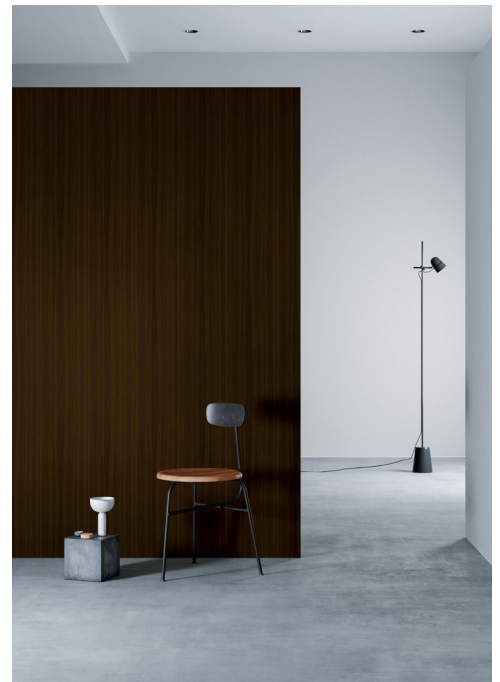
Product may vary in color, texture, finish and scale