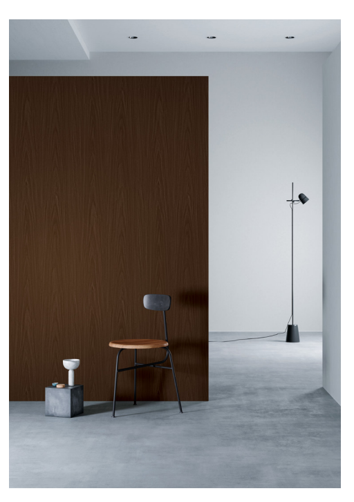
Product may vary in color, texture, finish and scale

Product Characteristics Product Performance Stain Resistance Resistance to Solvents, Cleaners and other Chemicals Cleaning and Maintenance Application and Removal Adhesion Compatibility with Application Surfaces