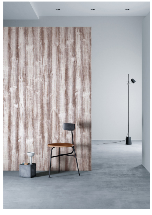
Product may vary in color, texture, finish and scale

Product Characteristics Product Performance Stain Resistance Resistance to Solvents, Cleaners and other Chemicals Cleaning and Maintenance Application and Removal Adhesion Compatibility with Application Surfaces