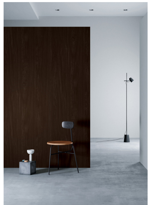
Product may vary in color, texture, finish and scale