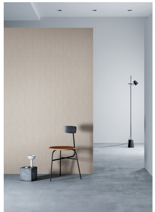
Product may vary in color, texture, finish and scale