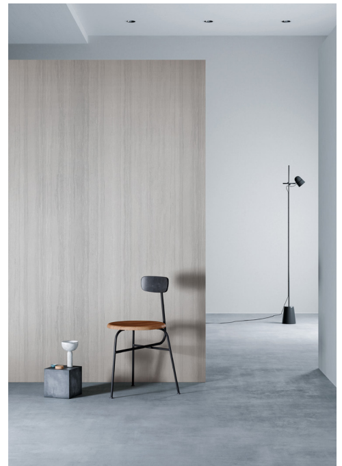
Product may vary in color, texture, finish and scale