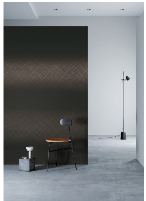
Product may vary in color, texture, finish and scale