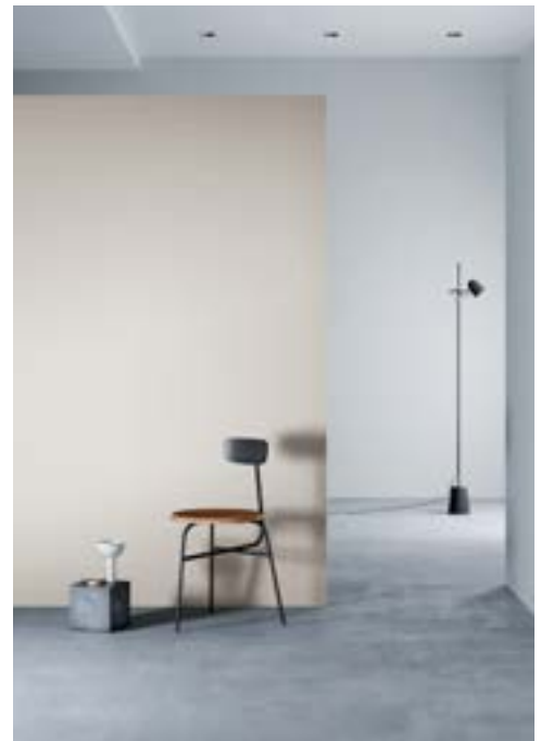
Product may vary in colour, texture, finish and scale