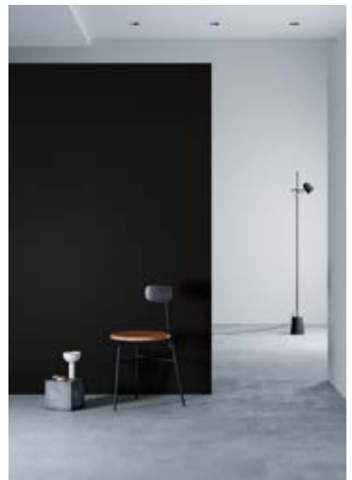
Product may vary in colour, texture, finish and scale