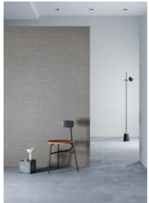
Product may vary in color, texture, finish and scale