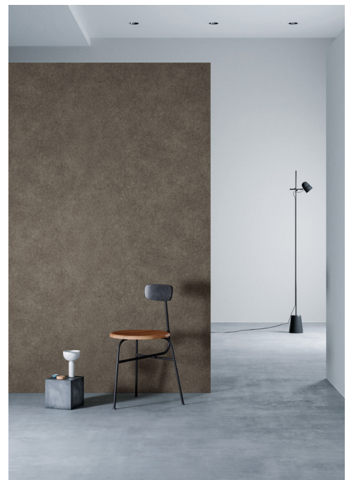
Product may vary in color, texture, finish and scale