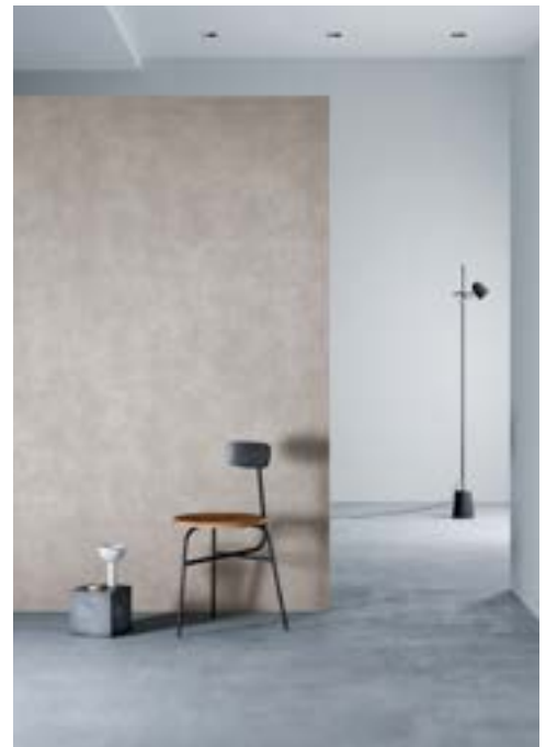
Product may vary in colour, texture, finish and scale